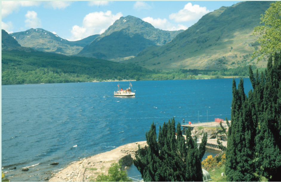
Inversnaid – linking Loch Lomond and the Trossachs.