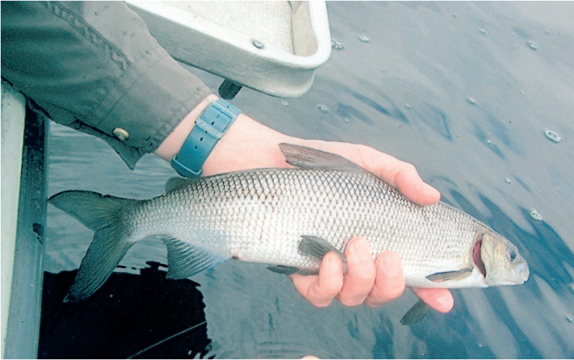
Plate 7. A fine specimen of powan caught by angler James Kirkland in Carron Valley Reservoir. This fish is probably at least fourth or fifth generation from the fry originally stocked in 1988 and 1989.