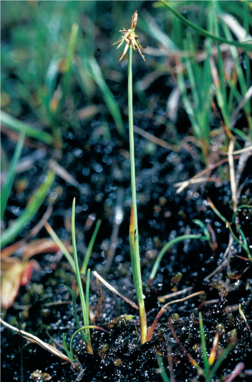
Plate 4. Carex microglochis .