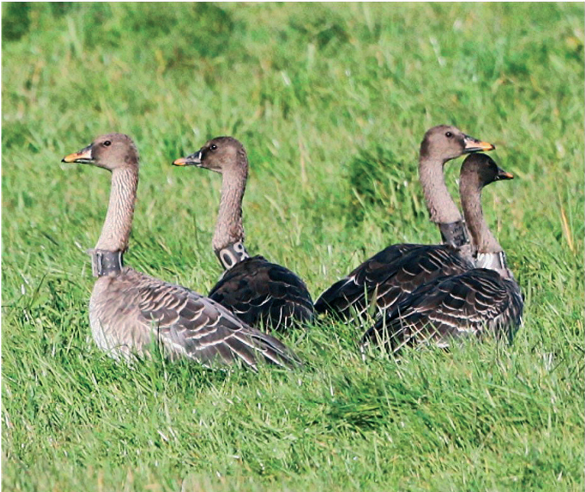
Plate 13. Bean Geese with GPS collars.