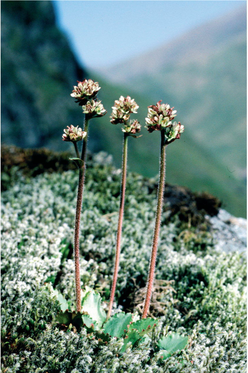
Plate 1. Saxifraga nivalis .