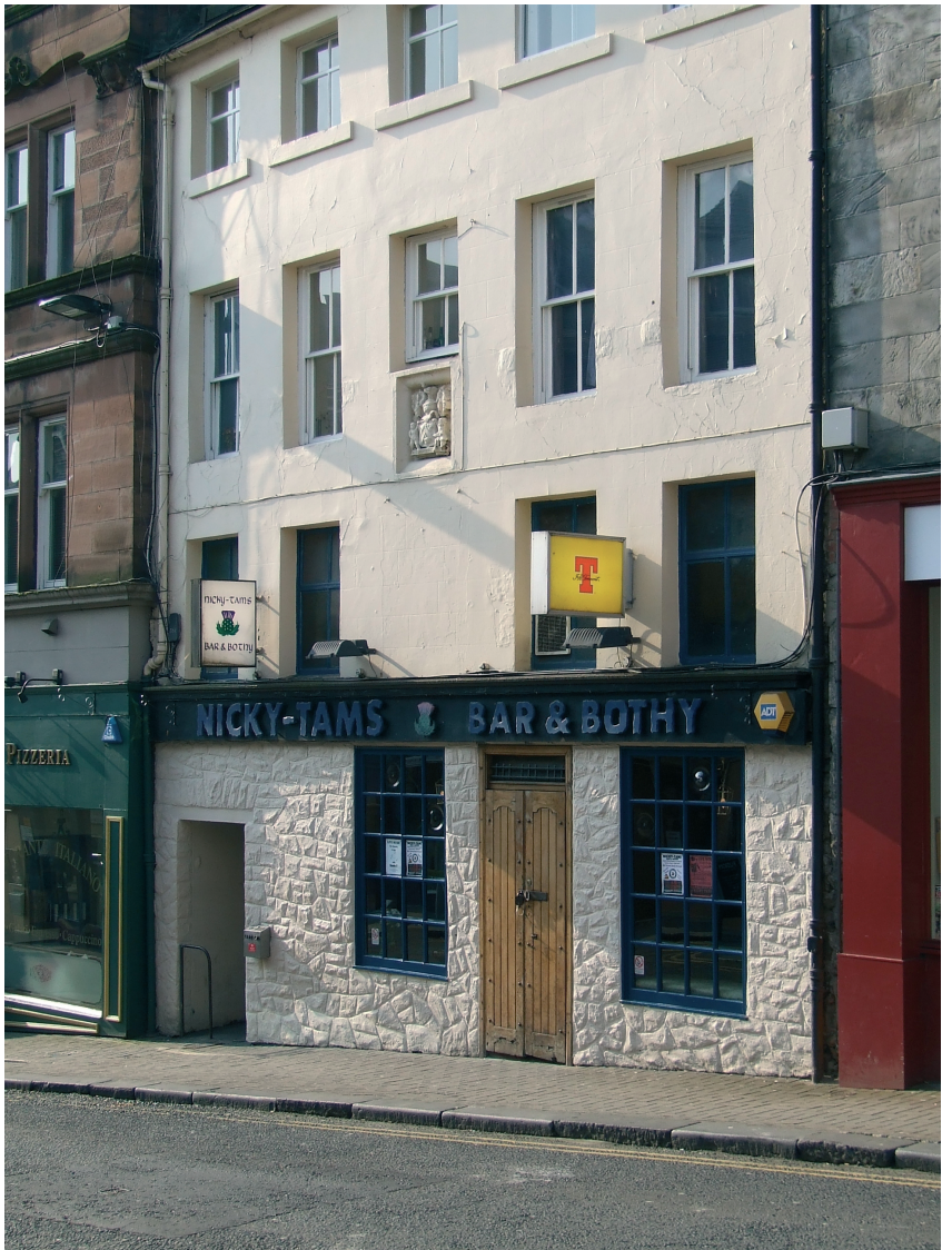
Plate 10. The former Caledonian Vaults on Baker Street with Weavers' arms above first floor windows.