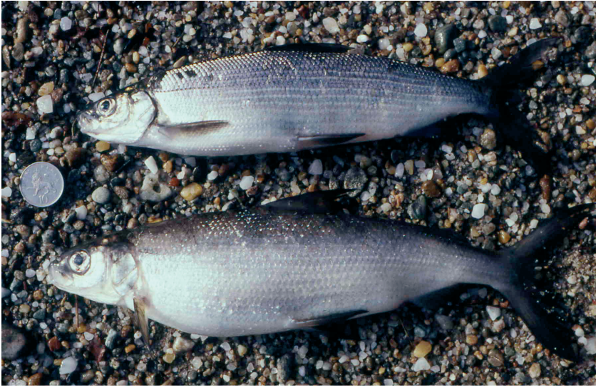
Plate 5. Two adult powan caught at spawning time in Loch Lomond: male, top; female, below.