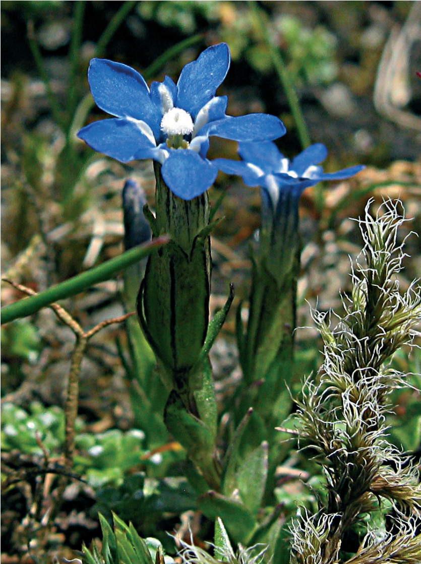
Plate 3. Gentiana nivalis .