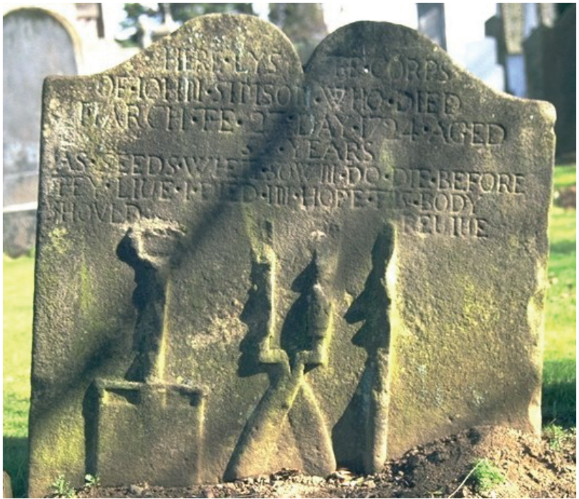
Plate 12. Gardener's gravestone of 1724 with gardening tools.