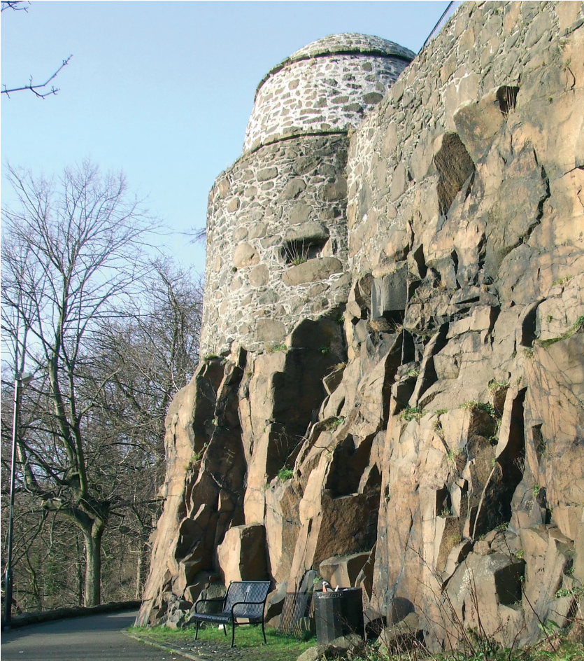
Plate 11. The doocot or former gun bastion on the town walls at Allan's School.