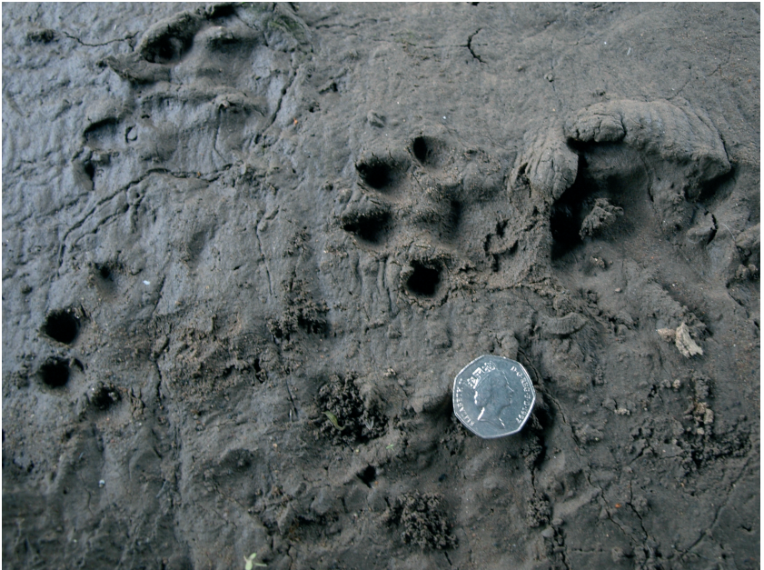
Plate 8. Typical otter 'spraint' on an exposed rock in a burn (upper) and footprint or 'spore' on river bank mud (lower).