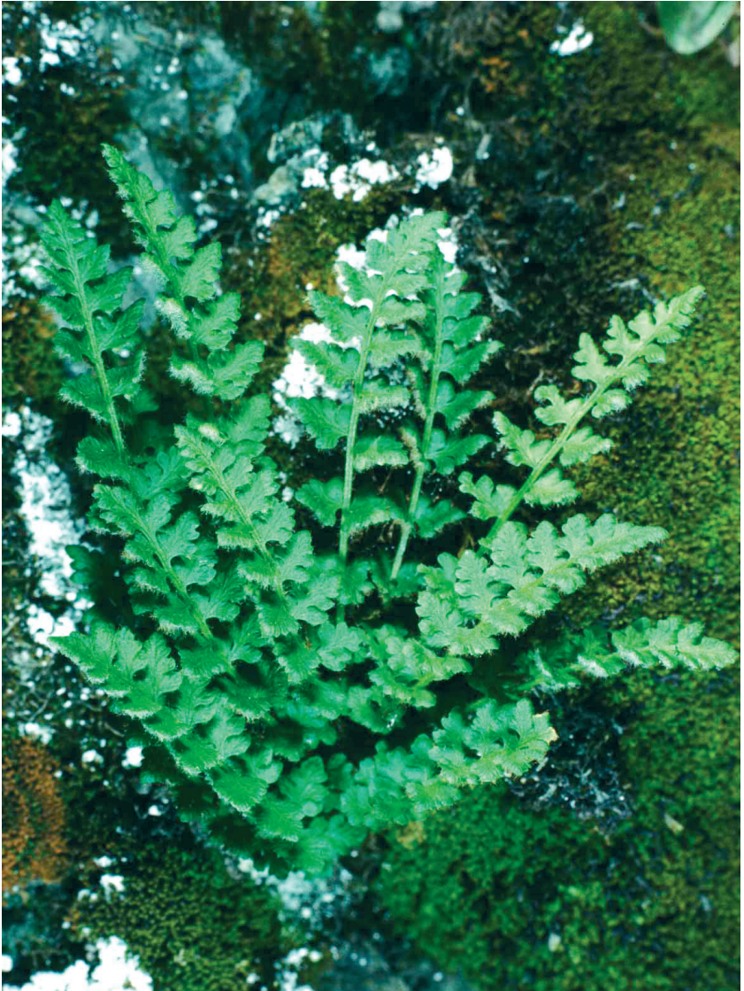
Plate 2. Woodsia alpina .